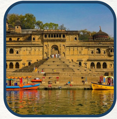
Maheshwar Ghats Take A Stroll