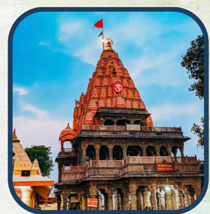
Mahakaleshwar Temple, Ujjain