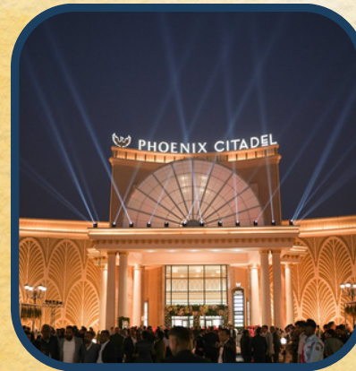
Phoenix Citadel Mall