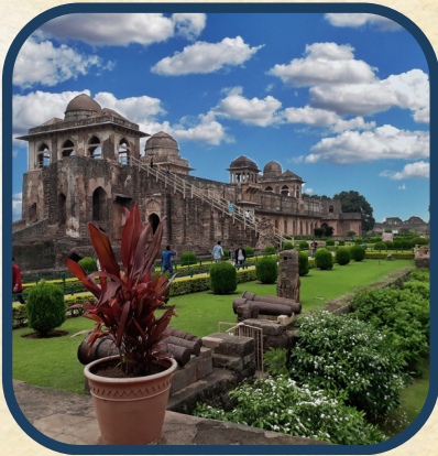
Mandu – Historical Tour