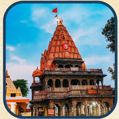
Mahakaleshwar Temple, Ujjain