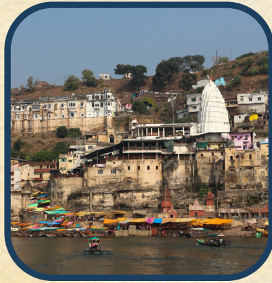
Maheshwar Ghats Take A Stroll